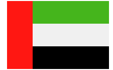
VEHICLE: KASSER II COMPANY: INTERNATIONAL GOLDEN GROUP COUNTRY: UNITED ARAB EMIRATES